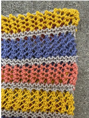
WITHOUT I-CORD EDGE